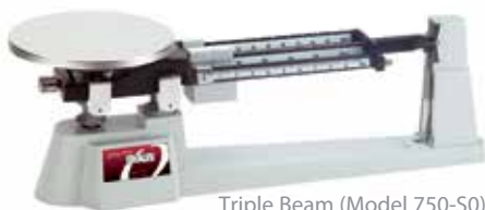
Triple Beam (Model 750-S0) 5 Year Warranty