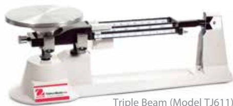
Triple Beam (Model TJ611) 3 Year Warranty

CHOOSE THE OHAUS TRIPLE BEAM THAT'S RIGHT FOR YOUR CLASSROOM