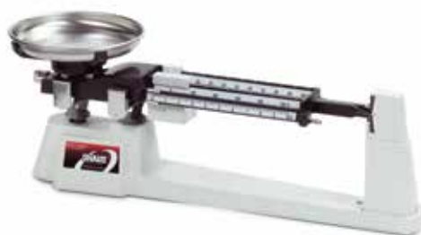
Triple Beam with Stainless Steel Pan (Model 710-00)