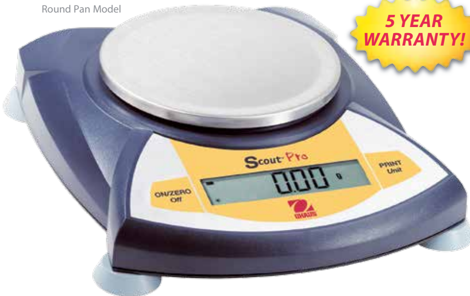
Round Pan Model