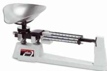
Triple Beam with Stainless Steel Scoop (Model 720-S0)