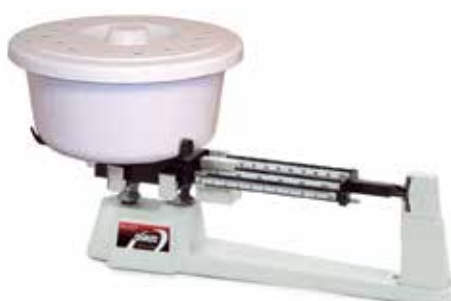
Triple Beam with Animal Container (Model 730-00)