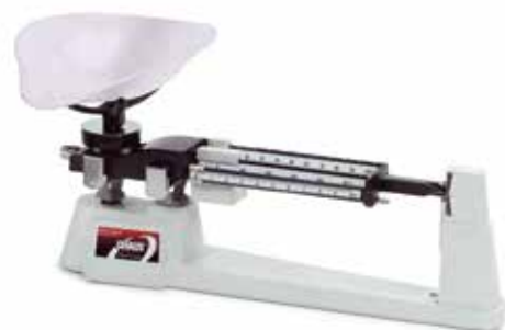
Triple Beam with Polypropylene Scoop (Model 720-00)