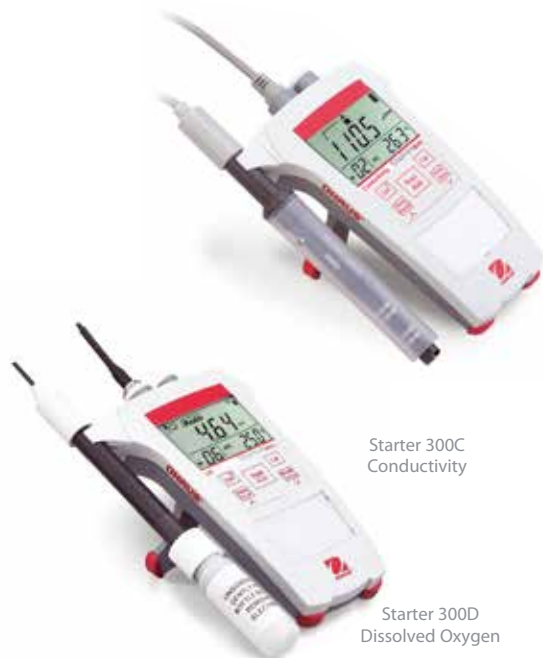
Starter 300C Conductivity

OHAUS portable electrochemistry products includes pH, conductivity, and dissolved oxygen meters that can also test for ORP and TDS. These portable meters offer convenience, reliability and durability in one compact design.