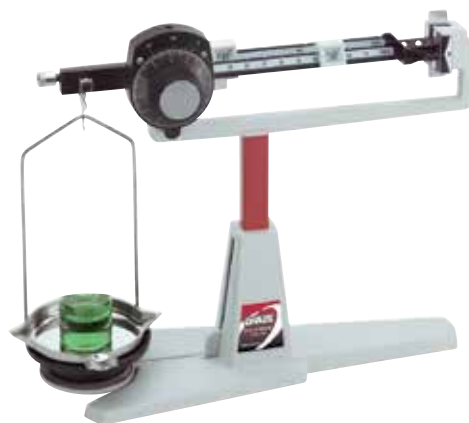
Dial-O-Gram United States Patent and Trademark Office Design Trademark Registration # 1,436,267

Self-aligning with beam design and special floating agate bearings, counterbalancing knob provides quick zeroing and stays in position, magnetic damping for quicker results, durable with aluminum pressure casting for the base and beam assembly, removable stainless steel pan.