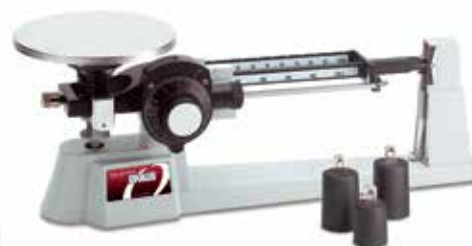
Dial-O-Gram® with Attachment Masses (Model 1650-W0)