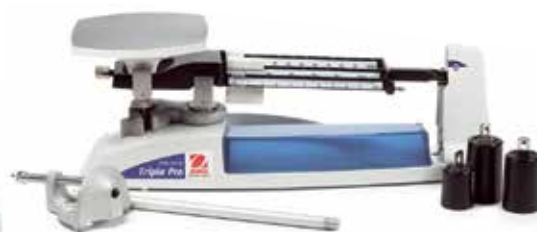
Triple Pro (Model TP2611) 10 Year Warranty