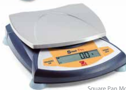
Square Pan Model