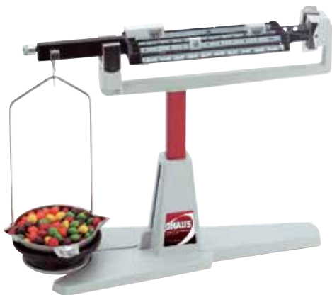
Cent-O-Gram United States Patent and Trademark Office Design Trademark Registration # 1,437,797