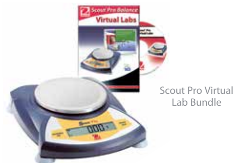
Scout Pro Virtual Lab Bundle